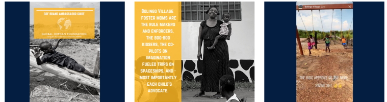
Brand Ambassador Guide